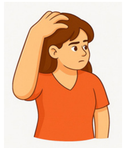
Figure 1. Location indicated by the patient as the site of the intermittent dysesthesia phenomenon. Illustrative image generated by AI to demonstrate the reported sensory distribution.

We evaluated a 53-year-old female with a 9-year history of intermittent tactile allodynia in the right parietal region. The affected area was round-shaped, approximately 6 cm in diameter. Episodes occurred around 6-7 times per year, each lasting four days. The patient reported significant discomfort when touching the area or combing her hair but did not experience any headache or spontaneous pain. The patient has a history of fibromyalgia. Magnetic resonance imaging of the brain was performed and revealed findings within normal limits for the patient's age. Written informed consent was obtained from the patient for publication of her clinical case.